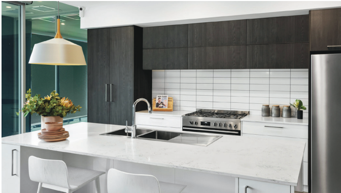
STONE BENCH TOPS, BREAKFAST BAR, OVERHEAD CUPBOARDS AND MUCH MORE

Our Designer Specification has features that makes your home complete from the moment you walk in. Fully Ducted Reverse Cycle Air Conditioning, LED downlights, high ceilings, Scullery, Designer Laundry, large floor tiles, European style tapware, showerheads and basins, carpets, amazing Designer Kitchen and more. Our Designer Kitchens feature an entertainer's stone island bench with breakfast bar, 900mm wide stainless steel freestanding stove, integrated rangehood and endless storage making cooking in your kitchen an absolute dream! Make your kitchen your own with your choice of cabinetry colours, splashbacks, and stone benchtops.