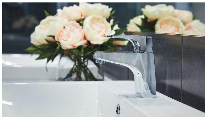
EUROPEAN STYLE FLICKMIXER TAPWARE THROUGHOUT