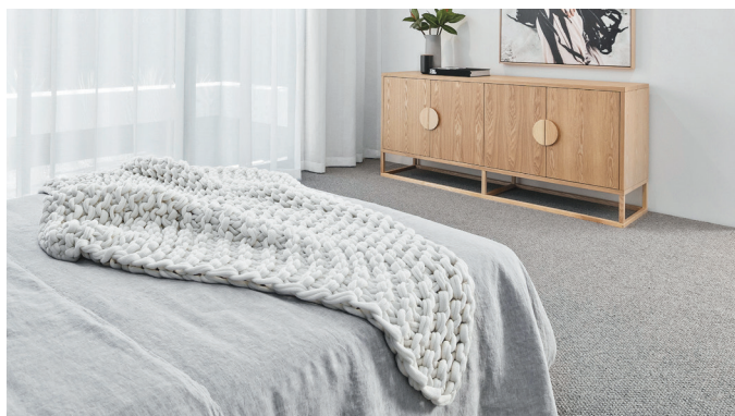
LOOP PILE CARPETS