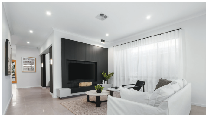
LED DOWNLIGHTS THROUGHOUT