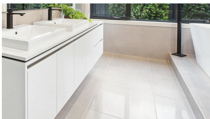
LARGER WET AREA TILES