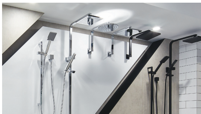
EUROPEAN STYLE SHOWER HEADS