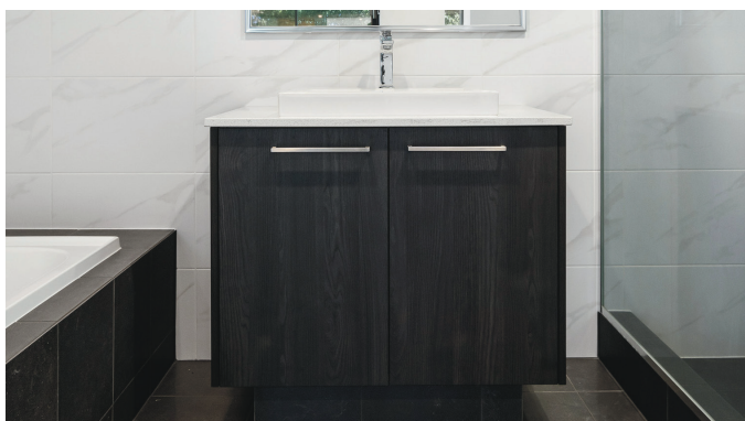
DESIGNER SINGLE VANITY