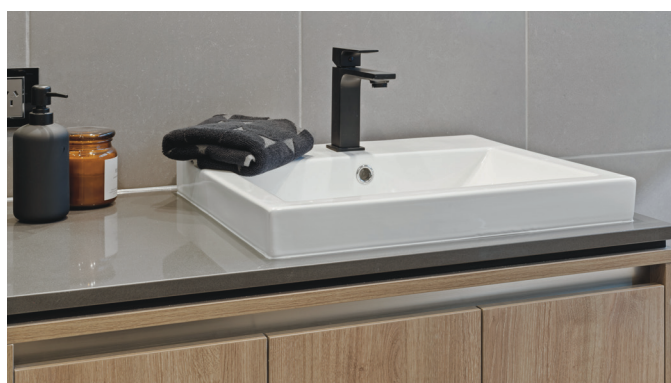
EUROPEAN STYLE VANITY