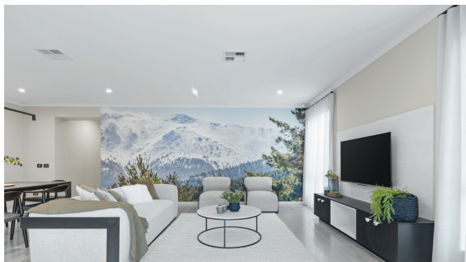
31C HIGH CEILINGS