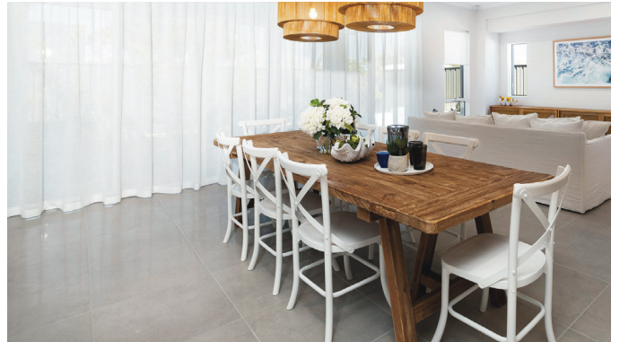
450MM X 450MM MAIN FLOOR TILES